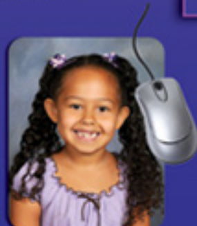
Neoprene Mouse Pad