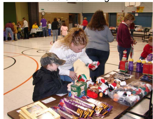
Holiday Shopping & Budgets